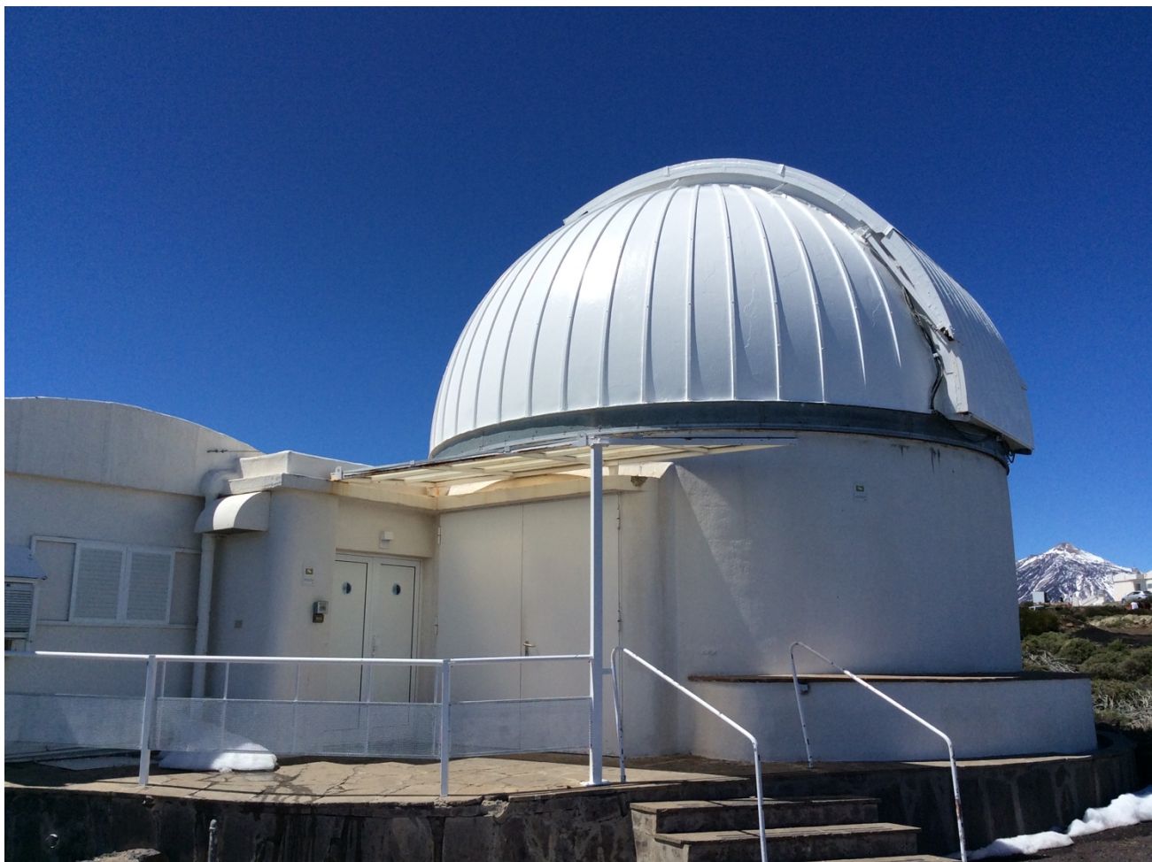
Dome of the 1.52-m Telescopio Carlos Sánchez at the Teide Observatory, Canary Islands, Spain.