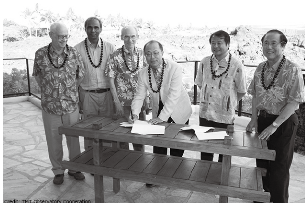
Figure 1: Signing of the Thirty-Meter Telescope (TMT) major agreement in July 2013. In attendance were officials from the National Astronomical Observatory of Japan (NAOJ) and international chief scientists representing five countries and six institutions.