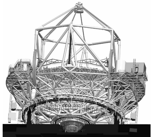
Figure 2: Preliminary design developed for the telescope's main structure.

Japan will perform the task of fabricating a near-infrared imaging camera and spectrograph known as IRIS, which is one of the three components of the first observational instruments to be installed prior to the commencement of TMT observation. Prototypes fabricated in FY 2013 include optical components and its supporting structure, a low temperature drive system, and a vibration-proof system. These components are necessary for attaining relative astrometry within a wavefront error of 30 nm and 30 \mu s. Discussions are underway for Japan to perform the fabrication of a camera system and other mechanisms such as the WFOS/MOBIE (Multi-Object Broadband Imaging Echellette), and conceptual designs were created in preparation of their construction.