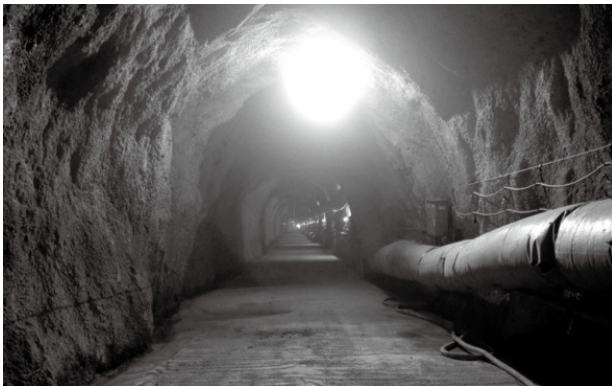
Figure 1: Picture of one of the KAGRA tunnels. The KAGRA tunnels excavation was completed in FY 2013.

During FY 2013 the prototype of the “payload” was assembled and it was tested in the 20m lab. The test of one of the KAGRA vibration isolation chains was started at TAMA. A frame around one of the TAMA vacuum chambers was built and tested for this purpose. The prototype of the pre-isolator